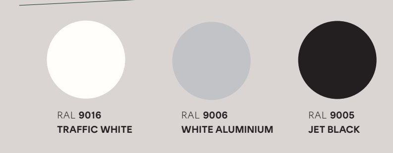
YELLOW & NEUTRAL