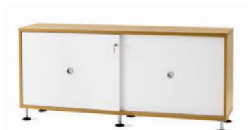
MOBYDISC by Ruud Ekstrand