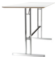
DISC UP by Ruud Ekstrand