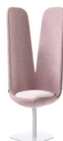
PETALS by Stone Designs