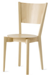
WOODY by Ruud Ekstrand