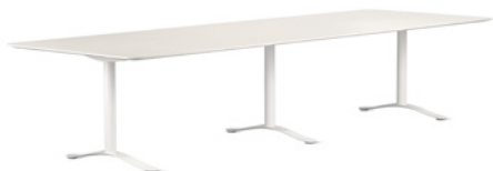
APLOMB by Everything Elevated