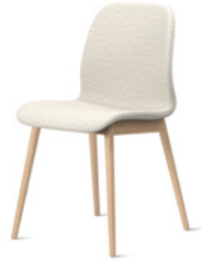
TIMEOUT