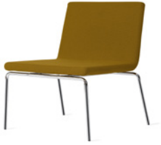
AFTERNOON by Claesson Koivisto Rune