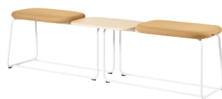
NEW! SOFT TOP by Brad Ascalon