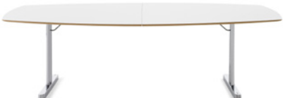
DISC UP by Ruud Ekstrand