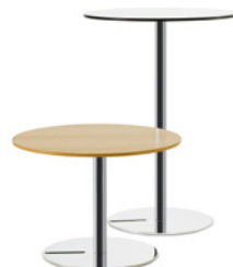
SLITZ by Mattias Ljunggren