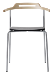
CORE by Mattias Ljunggren