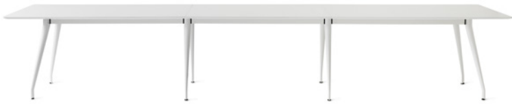
COLT by Ruud Ekstrand