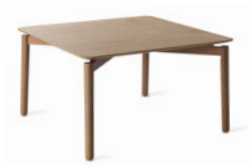
AFTERNOON by Claesson Koivisto Rune