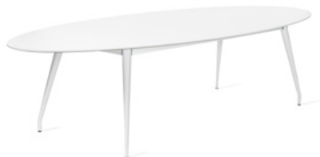
COLT by Ruud Ekstrand