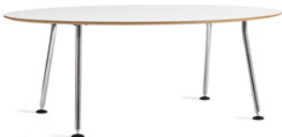
DISC by Ruud Ekstrand