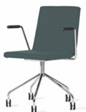
AFTERNOON by Claesson Koivisto Rune