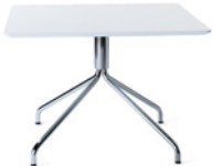
FLEX by Ruud Ekstrand