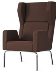
DROPP by Claesson Koivisto Rune