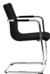
FLEX CL by Ruud Ekstrand