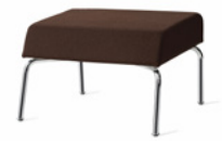
DROPP by Claesson Koivisto Rune