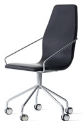
AEON by Claesson Koivisto Rune