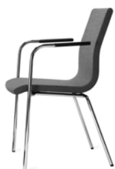
FLEX by Ruud Ekstrand