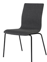
FLEX by Ruud Ekstrand