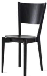
WOODY by Ruud Ekstrand