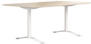
APLOMB by Everything Elevated