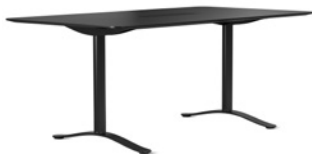
APLOMB by Everything Elevated