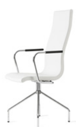
FLEX HIGH by Ruud Ekstrand