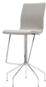
FLEX UP by Ruud Ekstrand