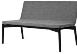
AFTERNOON by Claesson Koivisto Rune