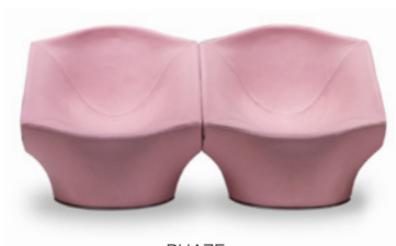
PHAZE by Karim Rashid