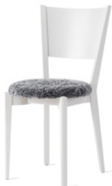
WOODY by Ruud Ekstrand