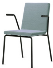
AFTERNOON by Claesson Koivisto Rune