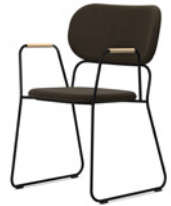
SOFT TOP by Brad Ascalon