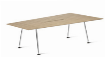
DISC XL by Ruud Ekstrand