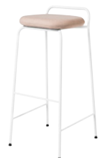
NEW! SOFT TOP by Brad Ascalon