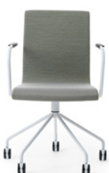
FLEX by Ruud Ekstrand