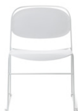
OVAL by Claesson Koivisto Rune