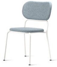
SOFT TOP by Brad Ascalon