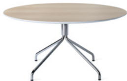
FLEX by Ruud Ekstrand