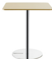
SLITZ by Mattias Ljunggren