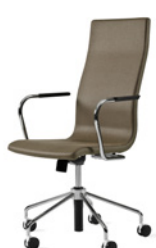
FLEX HIGH by Ruud Ekstrand