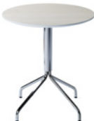
FLEX by Ruud Ekstrand