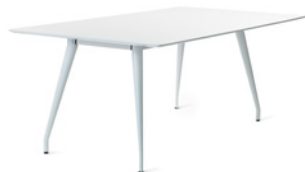
COLT by Ruud Ekstrand