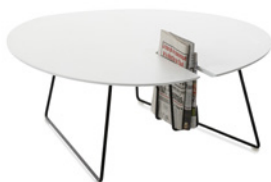
POND by Charlotte Elsnér