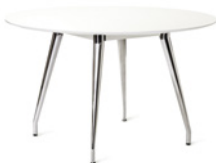
COLT by Ruud Ekstrand