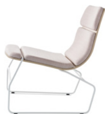
STRIPE by Oliver Schick