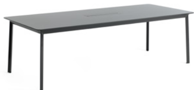
MODULOR by Claesson Koivisto Rune