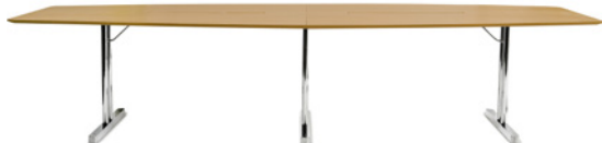
DISC UP by Ruud Ekstrand