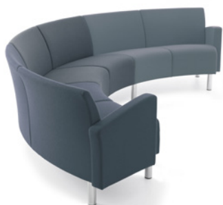
NONSTOP by Ruud Ekstrand