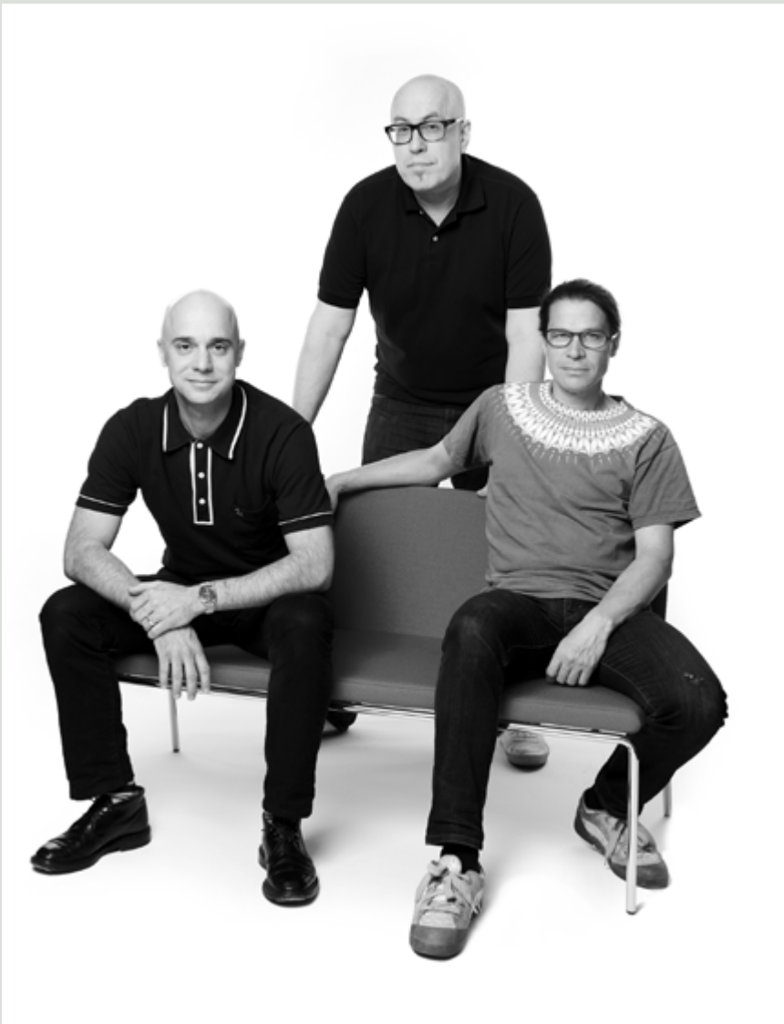
CLAESSON KOIVISTO RUNE