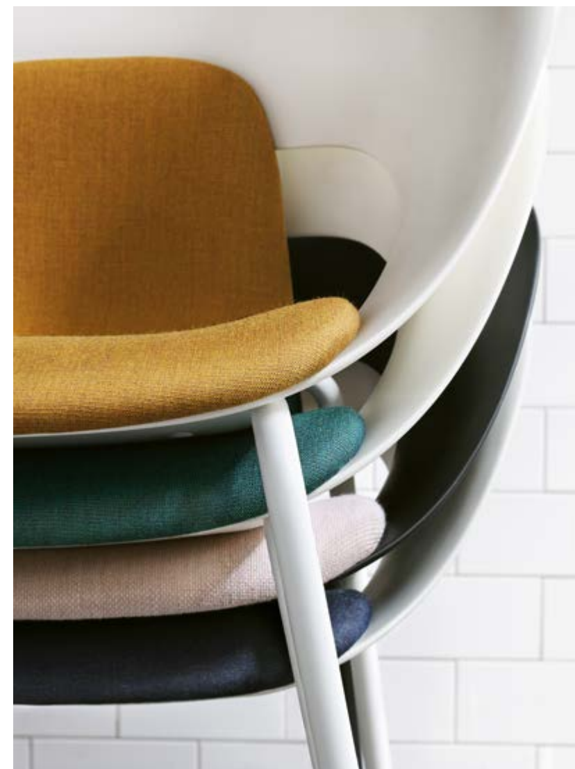
A stackable, linkable chair with an organically shaped seat shell, DELI attracts attention and provides comfort in every setting.