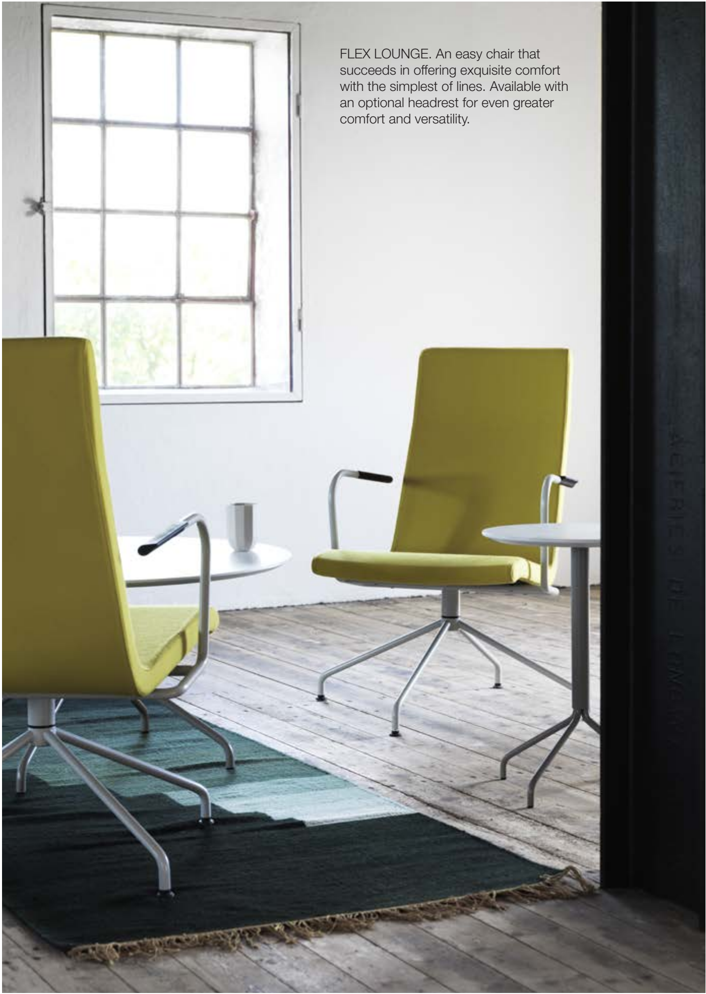
FLEX LOUNGE. An easy chair that succeeds in offering exquisite comfort with the simplest of lines. Available with an optional headrest for even greater comfort and versatility.