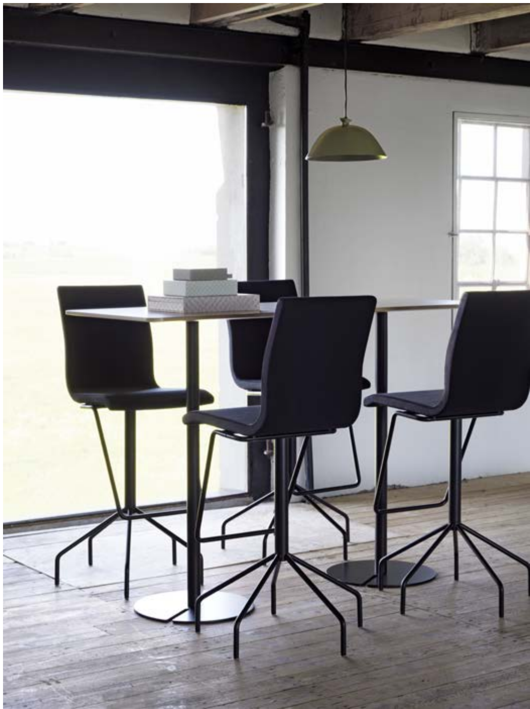
FLEX UP has been created especially for those who set their demands high. This bar chair raises the standard of modern office furnishings to a new level.