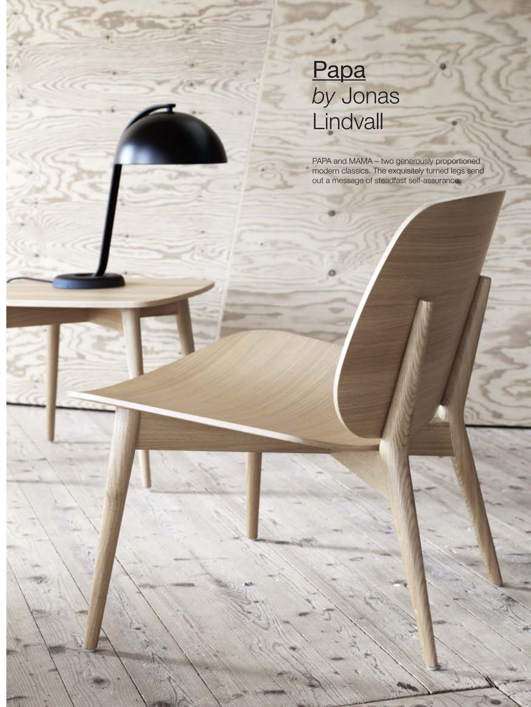
Papa by Jonas Lindvall

PAPA and MAMA – two generously proportioned modern classics. The exquisitely turned legs send out a message of steadfast self-assurance.